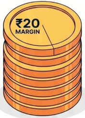
BEFORE (With Middlemen)