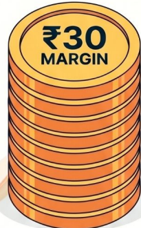
WITH FRYCOLD (Direct & Flat-Fee) Boost Your Margin from ₹20 to ₹30. Keep more of every sale by cutting out unnecessary middleman friction and costs.